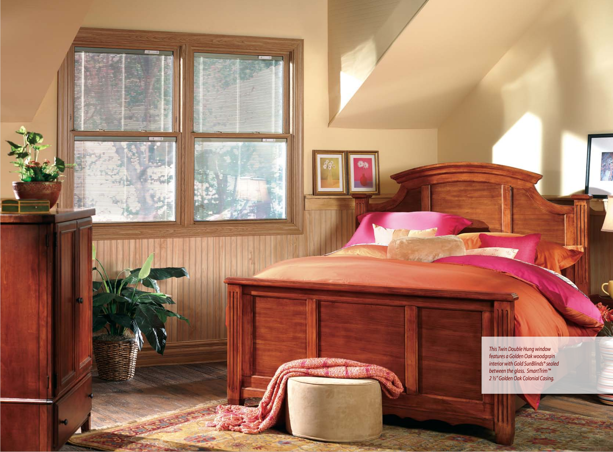
This Twin Double Hung window features a Golden Oak woodgrain interior with Gold SunBlinds® sealed between the glass. SmartTrim™ 2 1/2" Golden Oak Colonial Casing.