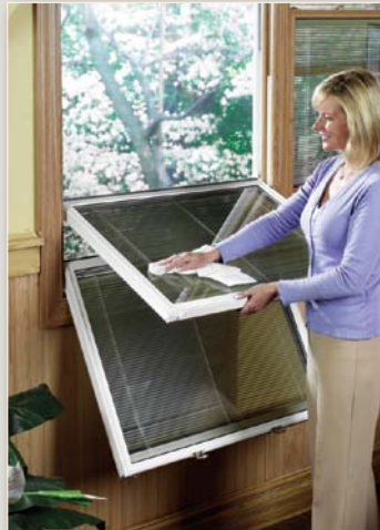
All Vanguard Double Hung windows feature two sashes that can tilt in to the home allowing for ease of cleaning.